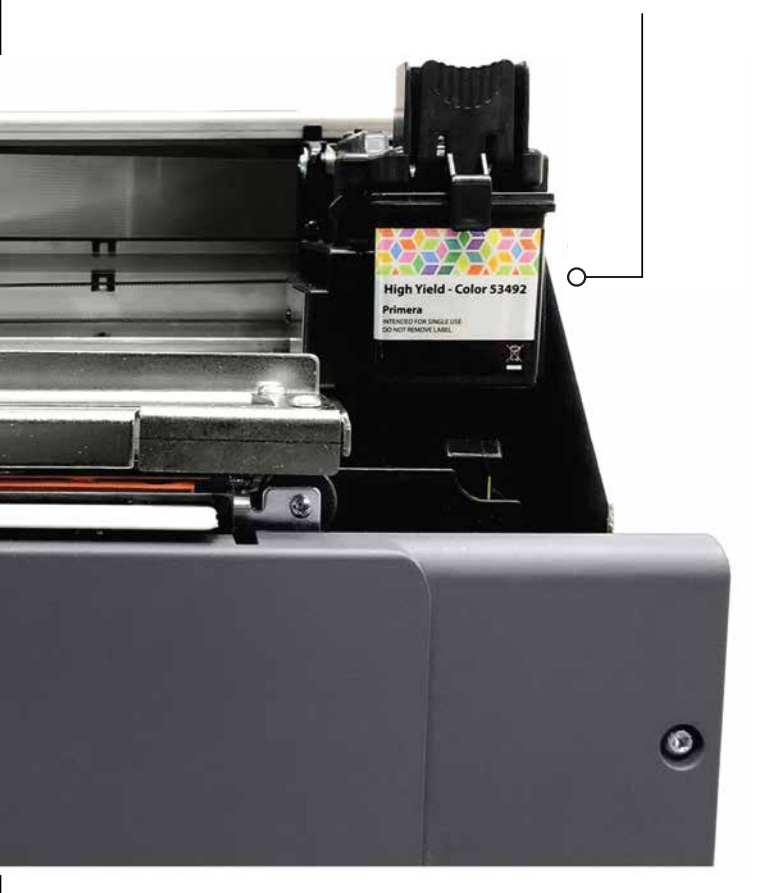
Under the Hood

LX910's technology allows you to switch between dye and pigment ink without having to change the print head.